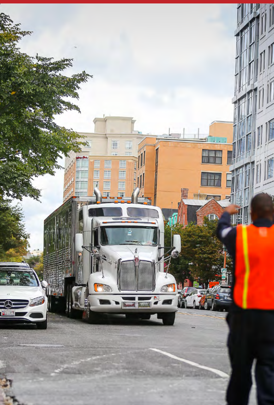
ABOVE: HORSES ARRIVING; BELOW: BEEZIE MADDEN & BREITLING LS.

Fencing separates the stabling from the sidewalk and street, but people walking by can easily see into the tent stabling and catch a glimpse of the behind-the-scenes action at a horse show. Horses on the way inside to the schooling area and show ring walk down the sidewalk, and grooms frequently let commuters